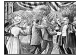
Instructional Resources Corporation

But as he left anthracite country that fall, he was a hero. His union had won what he described as "the most remarkable contest between labor and capital in the industrial history of our nation." As he rode out of the town of Hazelton, his carriage was accompanied by thousands of cheering breaker boys.