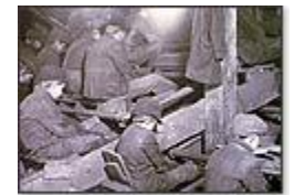
Instructional Resources Corporation

At age ten or eleven, the breaker boys graduated from the breaker and went into the earth with their fathers. There they worked until they died a natural death, were injured or killed, or contracted Black Lung. When their lungs filled up with coal dirt, they went back to where they'd started, to the breaker. As the miners used to say: "Twice a boy and once a man is a poor miner's lot."